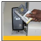
Figure 1 – Using the SmartCard reader